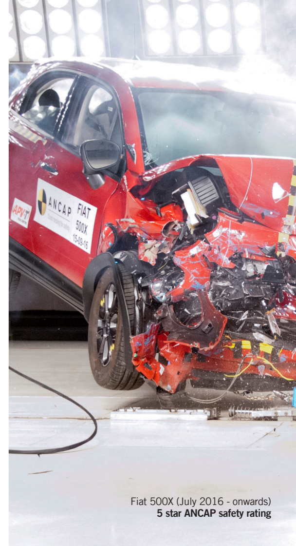
Fiat 500X (July 2016 - onwards) 5 star ANCAP safety rating

So, when making your next car purchase, look for the rating year datestamp to ensure you're buying a car which meets the latest safety requirements.